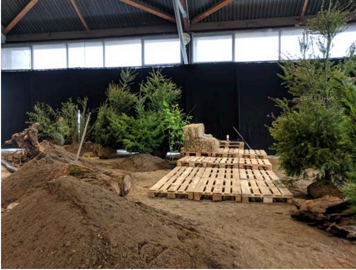
Day 3 - The pallets are in place for the floor of the longhouse. We continue placing trees with Carmen in charge and Andy as muscle. The rest of our plants arrive.