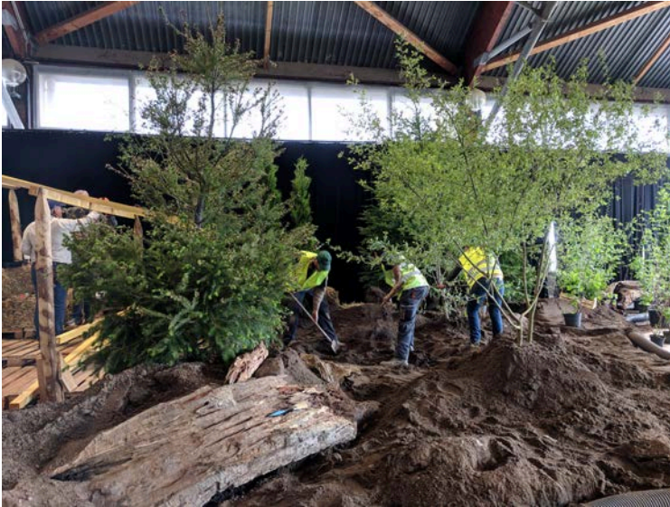
Day 4 - Our student helpers dig out the pond. The longhouse starts to take shape. We are treated to sparkling wine on the logistics platform. We regularly scavenge for extra logs and stumps, using google translate, gestures, and college-level french, which does not help us with vocabulary like “mulch”, “gravel”, and “backhoe”. Jenn places horsetails while Carmen brushes dirt off the log.