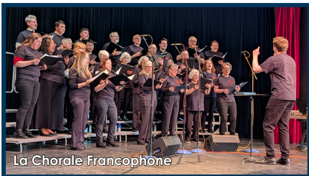
La Chorale Francophone