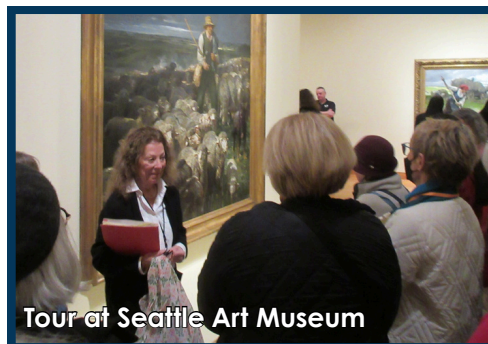
Tour at Seattle Art Museum